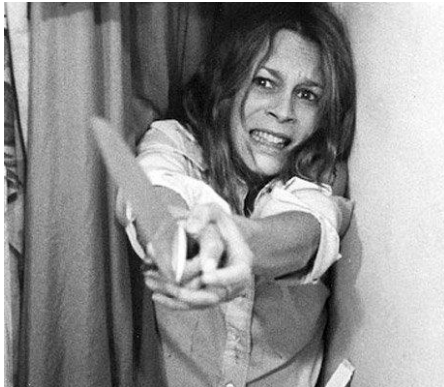
Jamie Lee Curtis in Halloween (1978)

For my self-directed research, I researched the concept of the 'final girl'. A female archetype in horror films. With this series I reflect on the concept of the 'Final Girl', which was prominent in horror slasher films between the seventies and nineties. The term was coined by Carol J. Clover in her book Men, Women, and Chainsaws: Gender in the Modern Horror Film (1992). Slasher films like Halloween and Friday The 13 th were incredibly popular in the 70s and 80s and sparked many sequels. Wes Craven's Scream parodied the classic tropes of these films in the late 90s. Although it was a parody, the Scream series itself sparked a renewed interest in the slasher film genre. The 'Final Girl' refers to the last girl or woman alive to confront the killer in the slasher movie. The Final Girl is a highly sexualised female protagonist with very specific characteristics and appearance.